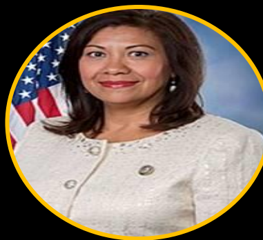
Norma J Torres Congresswoman, CA-35